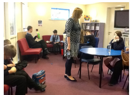
Indoor and outdoor recreation spaces in the Learning Support Department.