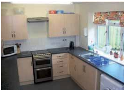
Kitchen in the Learning Support Department used for independent living skills