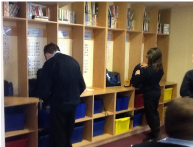
Individual locker space in the Learning Support Department.